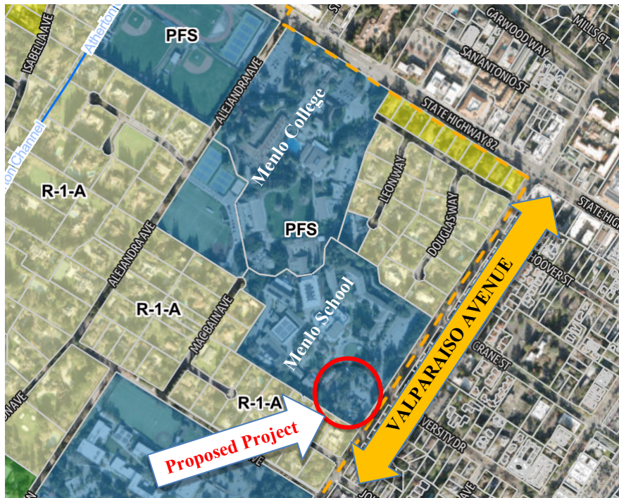
Map 2: Project Zoning Map

The project site (Menlo School) is located near the Town’s eastern boundary with the City of Menlo Park, and just south of California Highway 82 (El Camino Real). The 16.44-acre site includes a collection of academic and administrative buildings, athletic facilities, operations facilities, open space areas, and parking lots to support the middle school and upper school students and faculty on site.